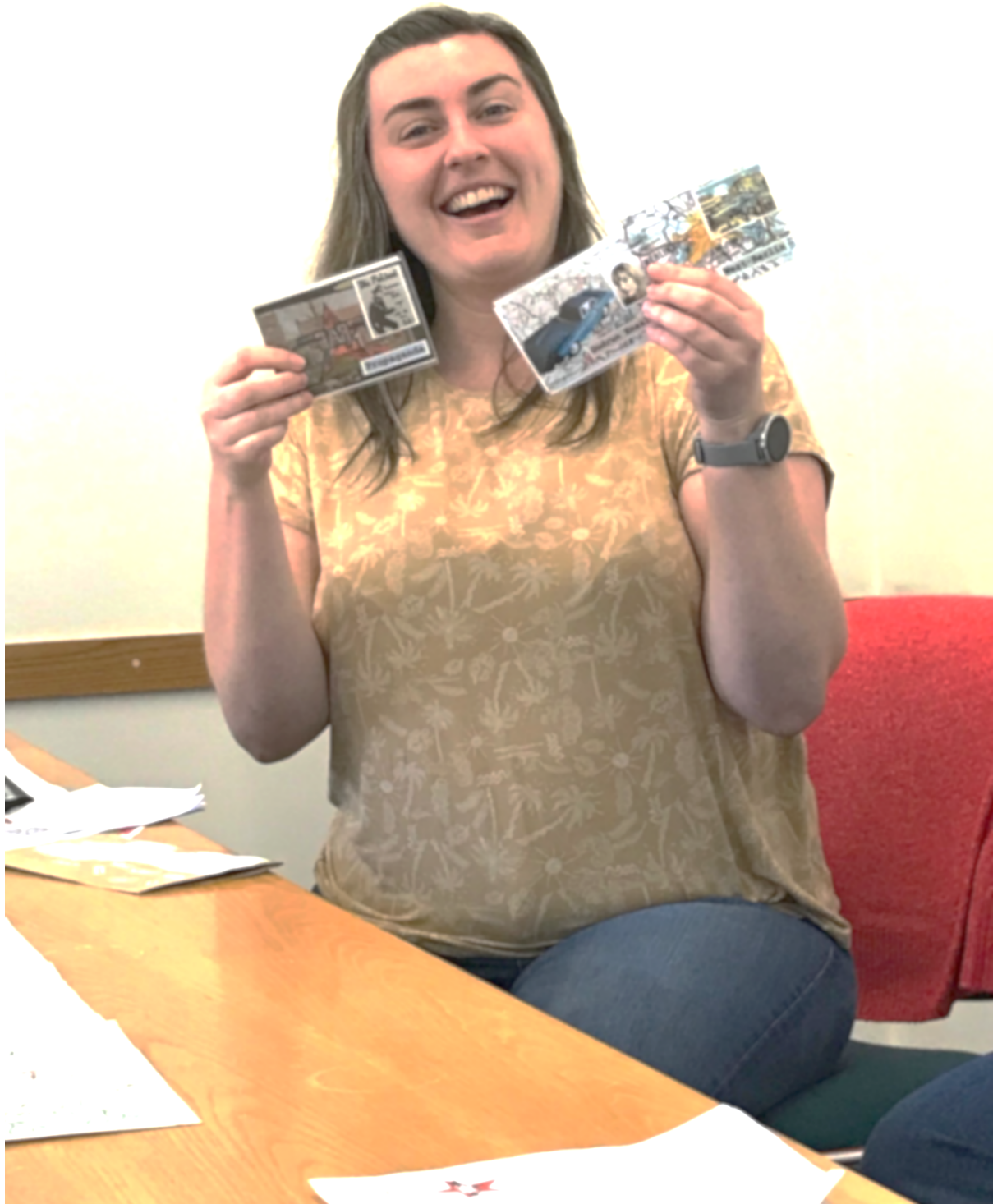
“Arrested: Gudrun Ensslin spreading illegal propaganda around West Berlin” – Charlotte solves the case against the Red Army Faction in a new record of 54 minutes.